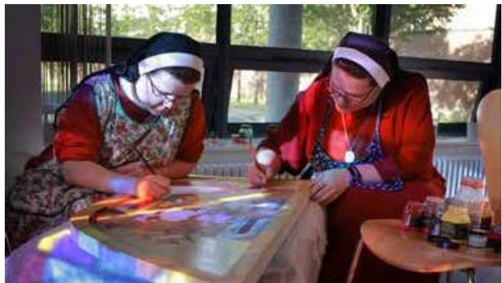
Sisters from the Monastery of St Alphonsus, Dublin, working on the official Icon of the Holy Family for World Meeting of Families 2018.